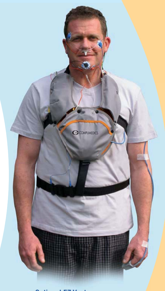
Optional EZ Vest for use with Somté PSG

Somté PSG System Part Number: 9023-0002-01